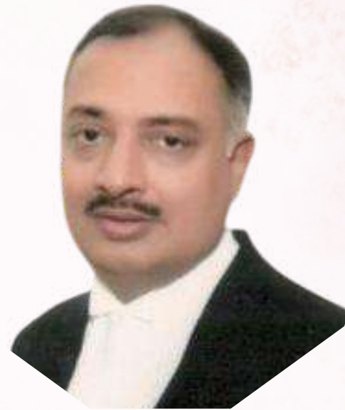
Hon'ble Mr. Justice Piyush Agrawal Judge, Allahabad High Court